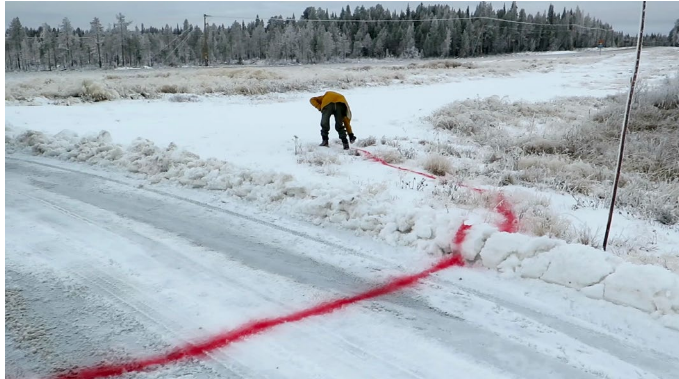
That What Was Seen, Could Be Seen (2018). Residence-in-Nature/ Lainio and Norrbottens Museum, Luleå Biennial 2018.