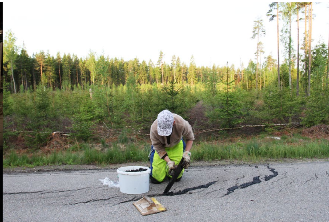
Highway 25, Shared Society Means a Common Debt . In collaboration with Johanna Gustafsson Fürst/Residence-in- Nature (2016).

In the work ( Figure 3582 ) Pleasure Culture , an elderly man is the doing body, meticulously repainting a red-and-white striped fence in the ferry dock in Nowy Port, Gdansk. Nowy Port is a historic site. This is where the Second World War started. It is also where the Solidarity movement of the 1970s and 80s began, followed by an innovative art scene. Today, the area is poverty-stricken, with unemployment and a